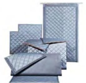
Enclose a loud machine or an entire area with quilted drapes

Our Silent Wall series holds its shape for years to come, while also offering the most secure and fastest installation system. A-WALL Building Systems , acquired by WP in 2021, manufactures modular offices along with in-plant buildings that are easy to install and relocate. They require fewer parts than comparable building systems and the electrical devices are factory-installed in the wall panels. This means your initial installation and future changes will require less time and cost.