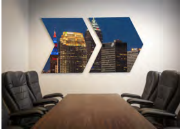
Custom shapes, colors & fabric types