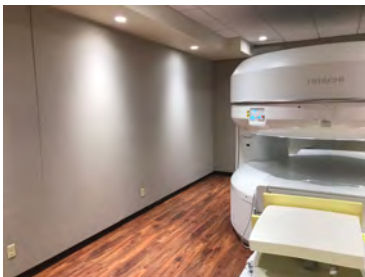
Medical-grade fabric & aluminum construction cause no interference with hospital machinery or equipment, unlike other panels on the market