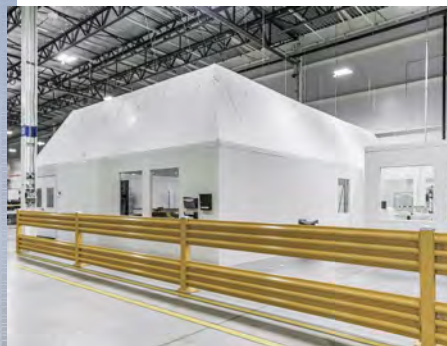
Modular freestanding partition walls fitted with acoustical hanging baffles to control noise transmission in an in-plant conference room