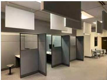
Additional noise reduction for cubical spaces