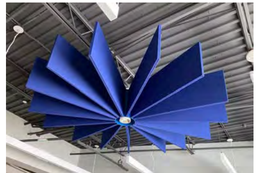
Aesthetically-appealing ceiling panels to control echo and reverberation