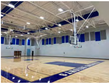
Commonly required in Gyms, Cafeterias & Auditoriums