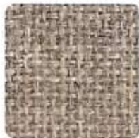
238 Grey Mix