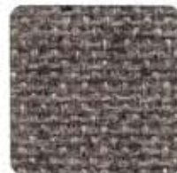
298 Medium Grey