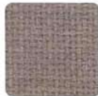
471 Steel Grey