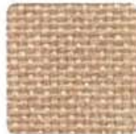
758 Desert Sand