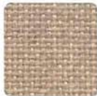
750 Cement Mix