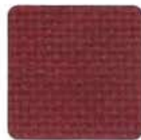
418 Claret Accent