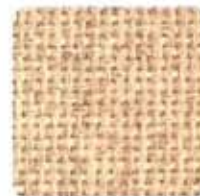
403 Vanilla Neutral