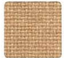
754 Light Moss