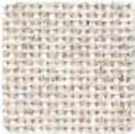
538 Silver Papier