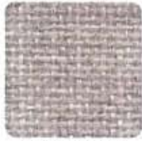
539 Blue Papier