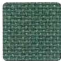
467 Blue Spruce