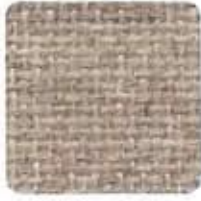
561 Verte Papier