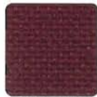
556 Deep Burgundy