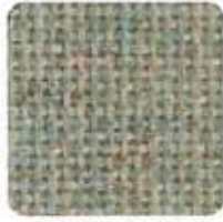
402 Green Neutral