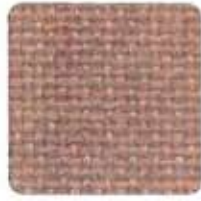
390 Rose Quartz