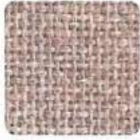
405 Lavender Neutral