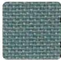
549 Chrome Green