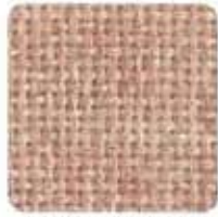
400 Cherry Neutral