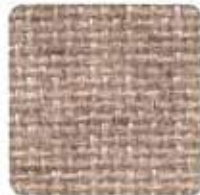
406 Silver Neutral