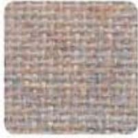
401 Blue Neutral