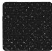
553 Blue Plum