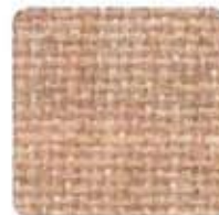
404 Apricot Neutral